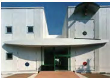
Morishita Studio (Main Building)