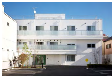
Morishita Studio (Annex)