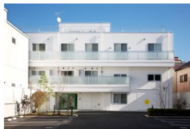
Morishita Studio (Annex)