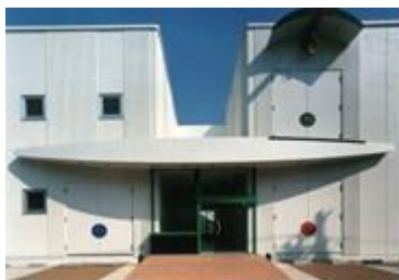
Morishita Studio (Main Building)