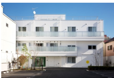
Morishita Studio (Annex)