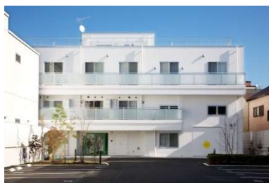
Morishita Studio (Annex)